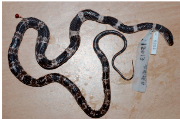
Fig. 4. Dorsal view of Lycodon fasciatus . CIB 9804, from Ruili City, Yunnan. Note the irregular bands.

Detailed comparisons with other species of the genus Lycodon appear below in the Discussion.