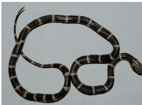
Fig. 1. Dorsal view of preserved holotype of Lycodon synaptor sp. n., BMNH 1905.1.30.63 from Dongchuan, 100 km north of Kunming, Yunnan Province, People's Republic of China.